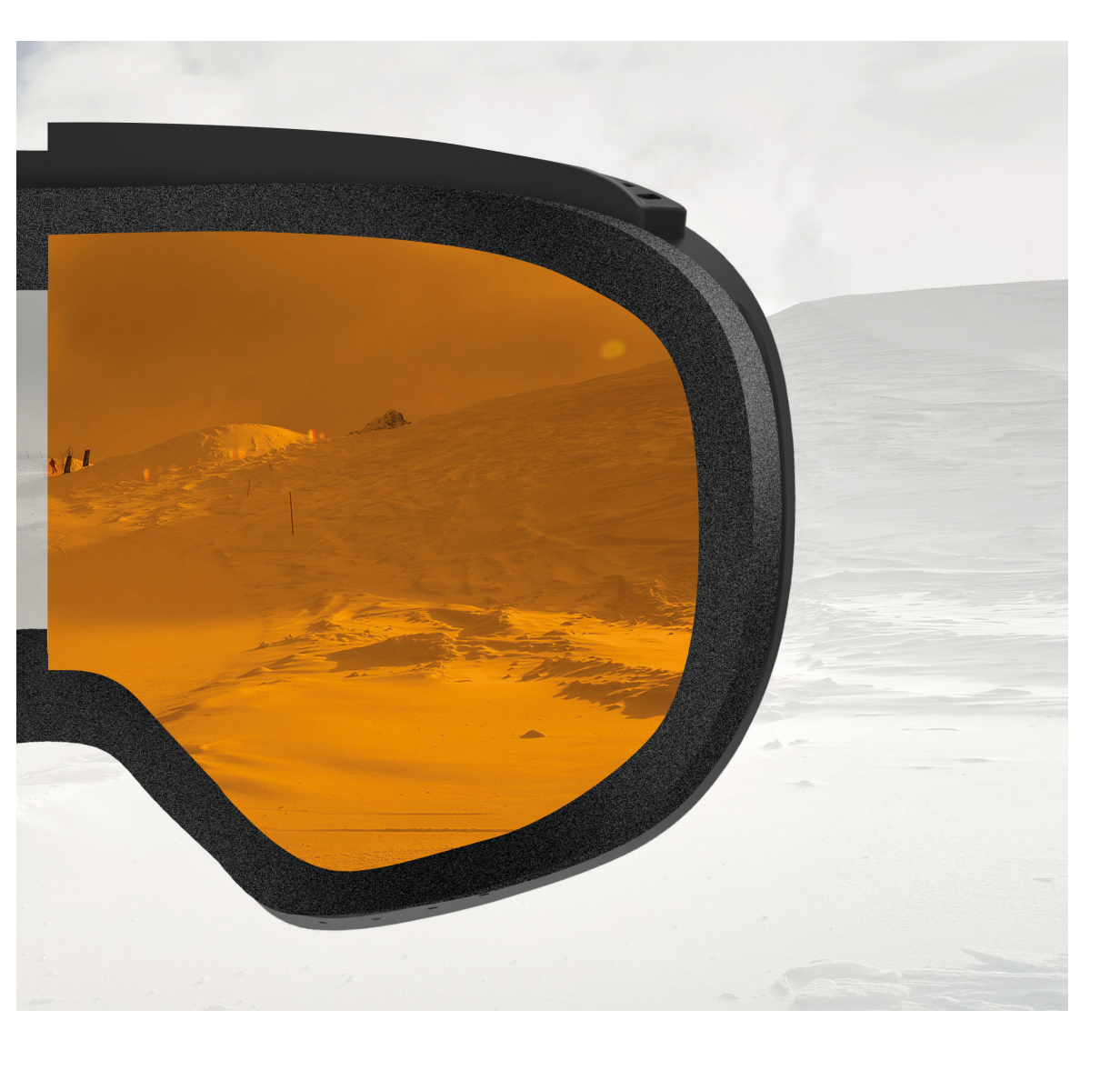
Better perception of bumps and hollows on the slopes Wider field of view